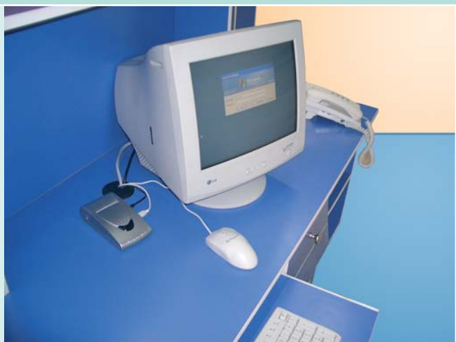
Callshop Operator's PC

Headquarters: 60 East 42 nd Street, #1166 New York, NY 10165, USA Tel: +1-877-649-5622